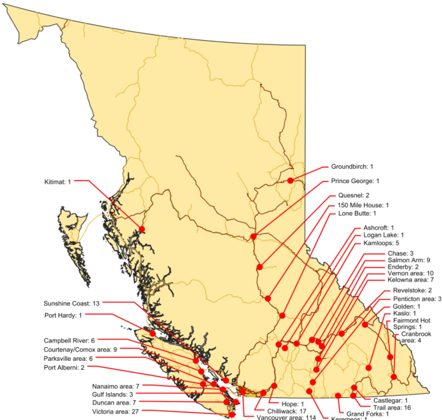
ABOVE: This map shows where all the 289 7th Division members live. The Yukon is part of the 7th Division, but is not shown here since we currently have no members there. To keep the map relatively simple some of the members living fairly close together have been grouped into area counts.

The membership roster has a field for date of birth, but the field is blank for about half the members, possibly due to changing membership information collection. It is possible to see that we have one member who is 99 years old, and one member who is 21, but there are likely younger members out there.